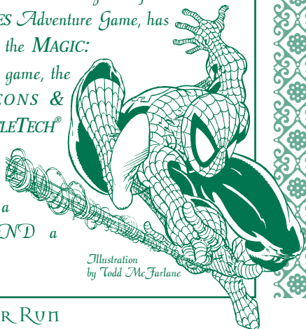
Illustration by Todd McFarlane

THE GATHERING® card game, the ADVANCED DUNGEONS & DRAGONS® game, the BATTLETECH® Trading Card Game, and the ALPHABLITZ® family card game. He owns a Silver Surfer tie AND a Fantastic Four tie. ~