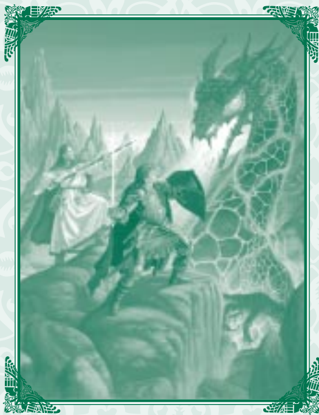
"Dragons of Summer Flame"

Such are the conclusions we've come to about the timeline for this book. What do you think? If you wish to respond to this question, please write to "Talk Back"; LEGENDS OF THE LANCE editor; P.O. Box 707; Renton, WA 98057-0707 or legends@wizards.com. ~