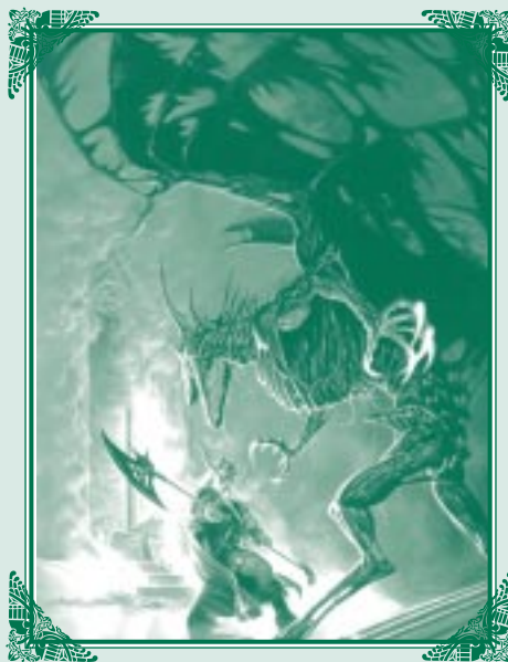
Cover illustration by artist Todd Lockwood for the novel The Last Thane

A kind of decree came down saying the game was called DUNGEONS & DRAGONS, but they’d never